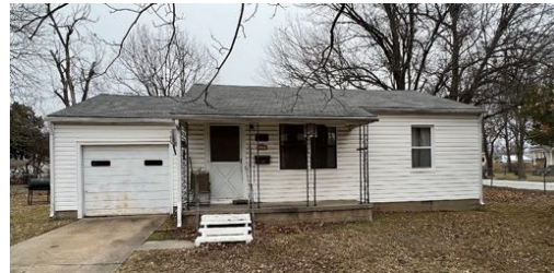
The Watt home