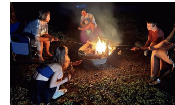
Around the Branson campfire

If you would like to help us to cover some of the cost of this trip and make it more affordable for students, we welcome your help. Registration is $250. Add to that the cost of fuel and a night (or two) in motels as we travel and the expenses add up quickly. You can give via our website or send a contribution in the enclosed envelope.